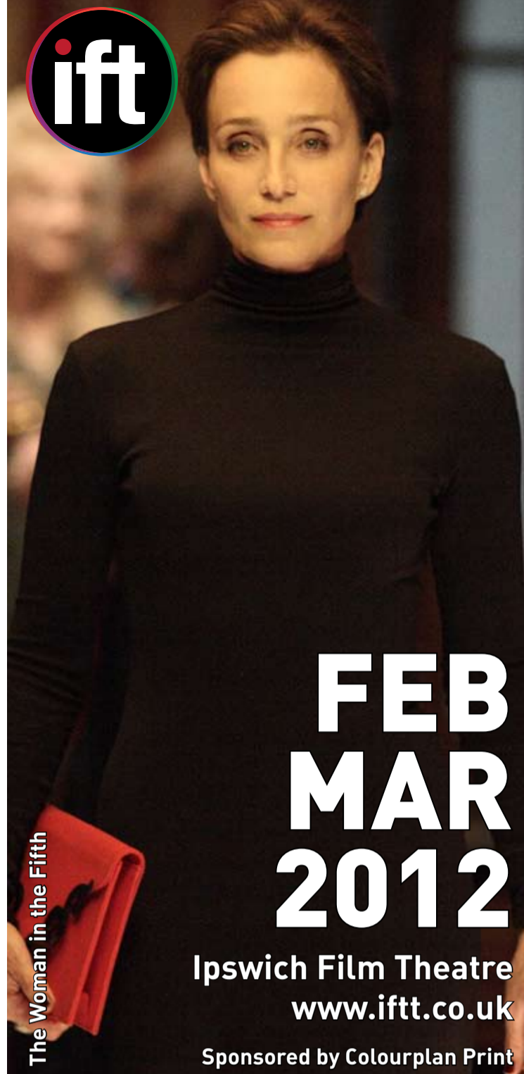
The Woman in the Fifth