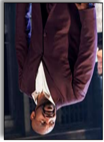
Starring Lenny Henry

place of wonderment and terror, where baffling gifts and to the outsiders it appears a home. A buzzing metropolis, foreign to their distant arrive in a land entirely search of their brothers, his servant Dromio who, in Antipholus of Syracuse and And for no one more so than confusion on a grand scale. mistaken identities lead to one crazy day, as multiple city without meeting on at birth collide in the same Two sets of twins separated